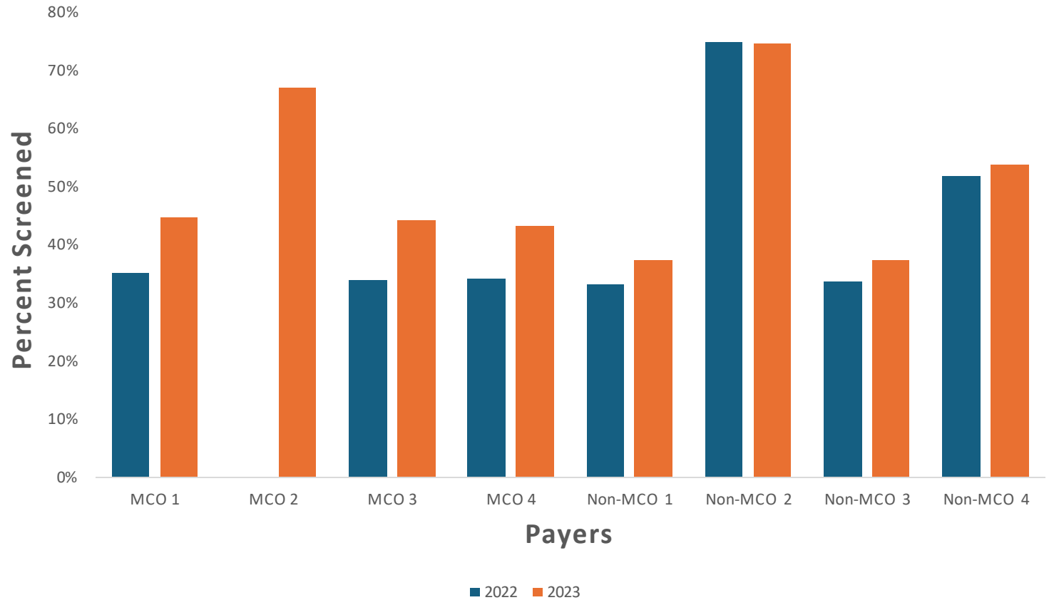
Preliminary: Colorectal Cancer Screening Percentages by Payer ('22 & '23)